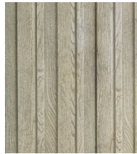
SMOKED OAK - MCB320D