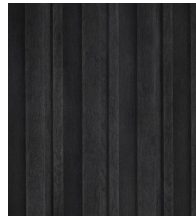
BURNT CEDAR - MCB320R