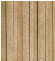
GOLDEN OAK - MCB320G