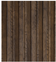
ANTIQUE OAK - MCB320A